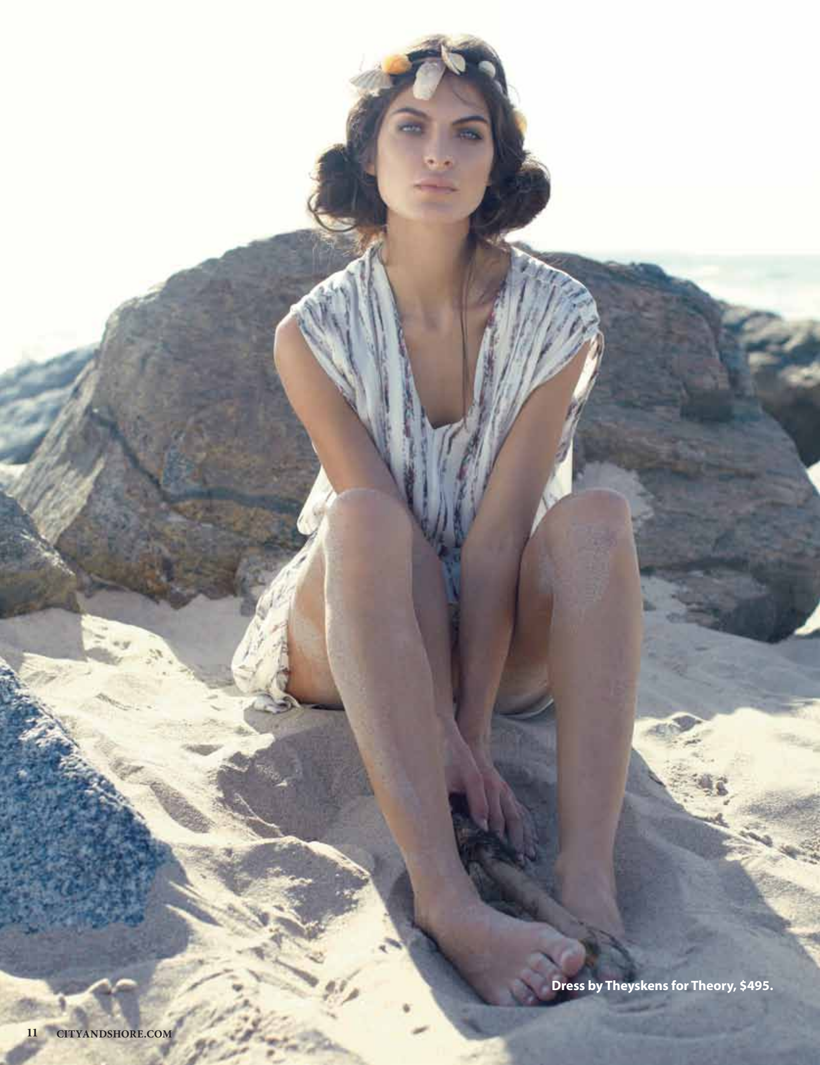
Dress by Theyskens for Theory, $495.