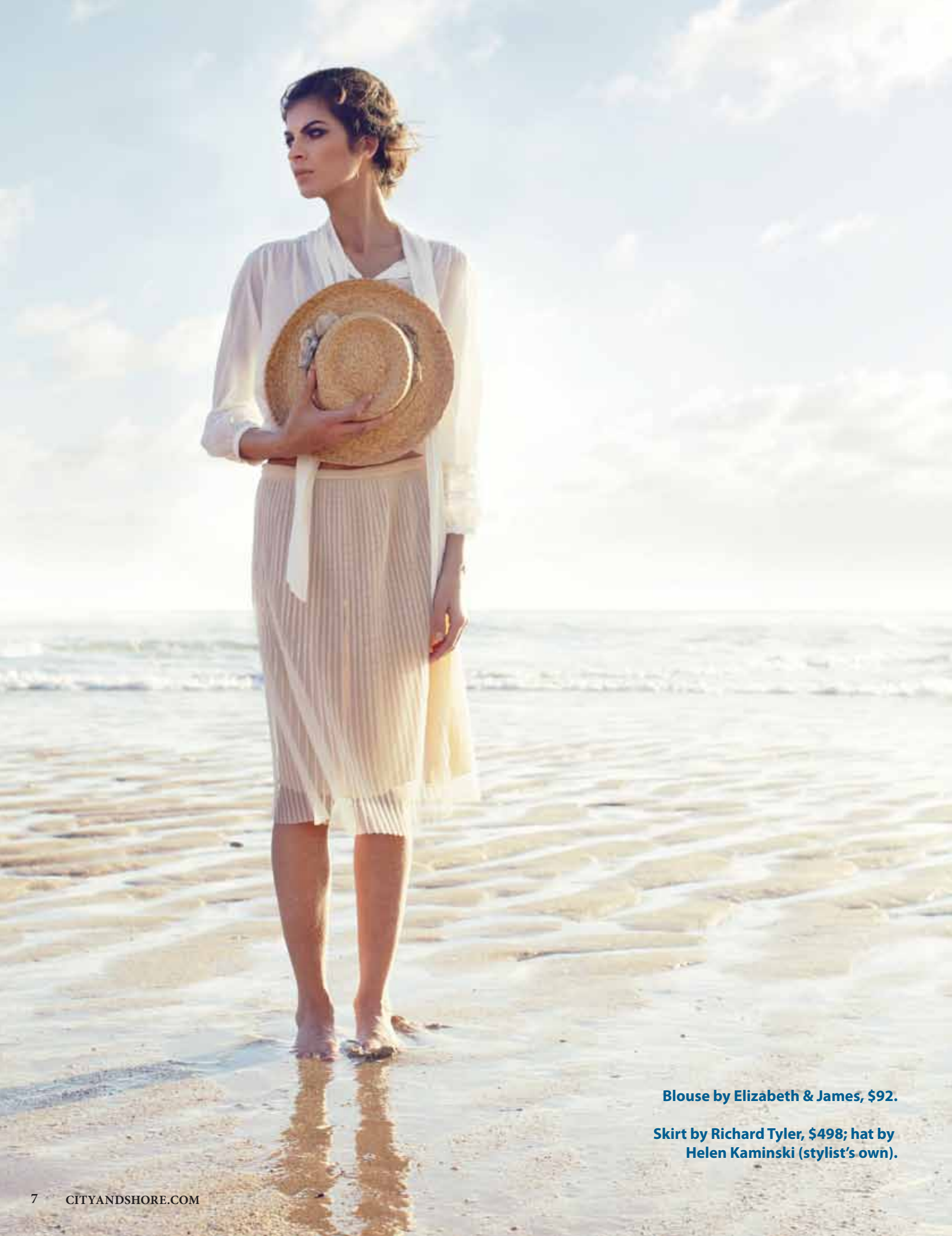
Blouse by Elizabeth & James, $92.