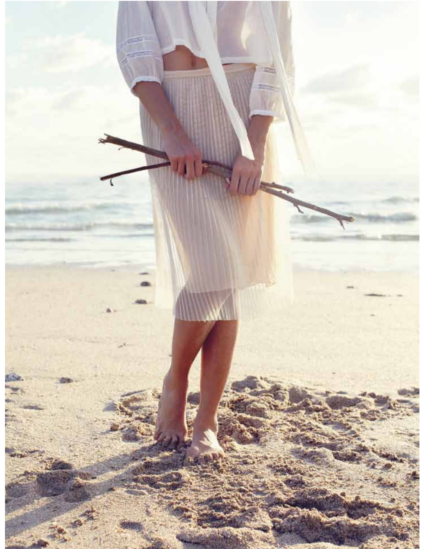
Skirt by Richard Tyler, $498; hat by Helen Kaminski (stylist's own).