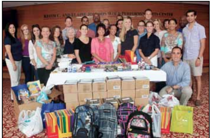
LifeNet4Families provides more than 700 school children with backpacks and supplies: The "Donation Team" at Lynn University in Boca Raton collected $1,500 in school supplies.